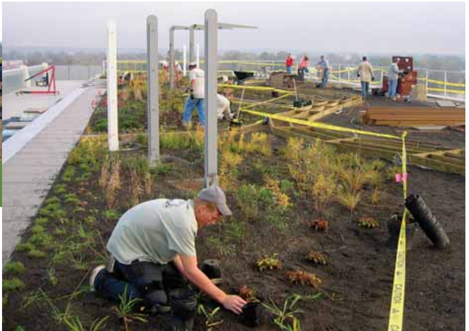
The green roof on the Clinton Presidential Library begins to take shape.