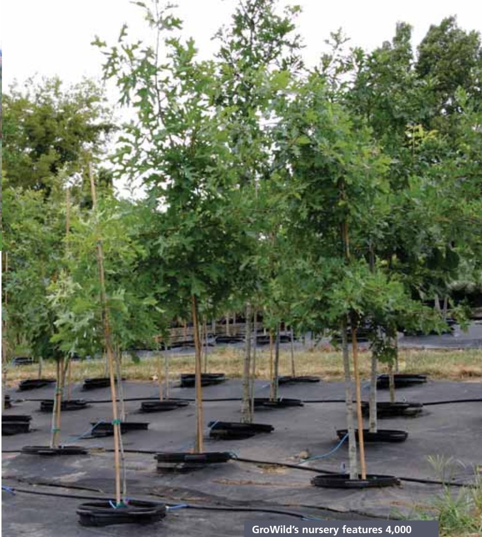
GroWild's nursery features 4,000 trees growing on a 7 percent slope.